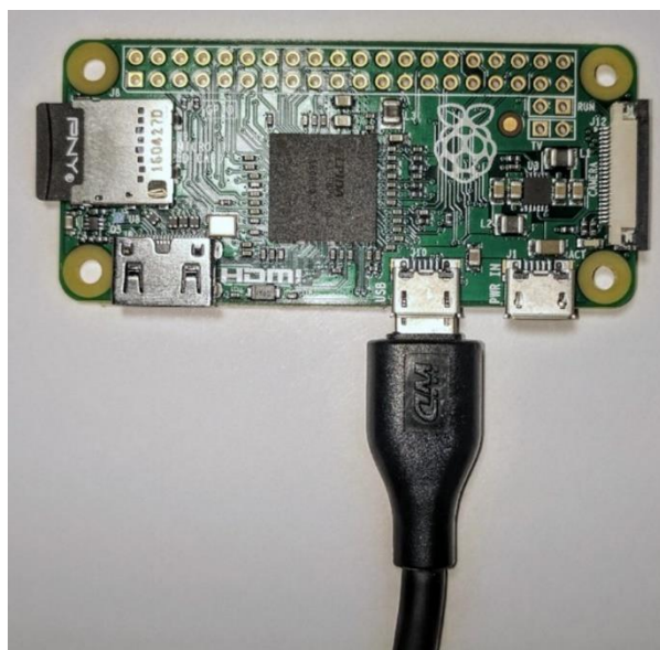
Illustration 2: Proper connection of microUSB cable when connecting to a laptop.

The hardware specifications for the Raspberry Pi Zero are nearly identical to the specifications of the original Raspberry Pi. The processors are the same model, but the Raspberry Pi Zero's single core processor is clocked at 1Ghz to provide a noticeable speed boost over the older board. The memory remains the same as the older board at 512MB. What differentiates the Raspberry Pi Zero from all other models is that the microUSB communication port is configured as a USB OTG port, allowing it to act as either a USB host or client device. This new feature presents another approach that has the potential to reduce many of the problems of the traditional Raspberry Pi based solution.