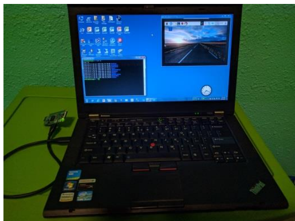
Illustration 3: Raspberry Pi Zero connected to a Windows 7 laptop with a single USB cable for power and communication. Shown with PuTTY and VNC sessions open.

selects the folder appropriate for their laptop Operating System and executes the appropriate application. The VNC application presents the student with the graphical remote desktop interface of the Raspberry Pi Zero, and the PuTTY application presents the student with a remote terminal session to the Raspberry Pi Zero.