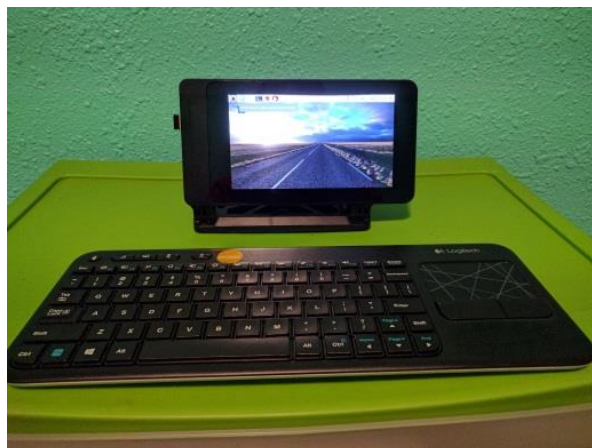
Illustration 1: Raspberry Pi 3 configured as a portable computer with a 7-inch touch screen and portable wireless keyboard.

The Model B versions of the Raspberry Pi include built-in Ethernet ports that support 10/100Mbit Ethernet. The Ethernet ports on the Raspberry Pi feature auto crossover detection, so that they can be used with standard Ethernet patch cables. A short network patch cable between the Ethernet port of the Raspberry Pi and the Ethernet port on the laptop provides the necessary physical network connection between them. The Raspberry Pi board can be powered directly from a USB port on the laptop, so a short USB to MicroUSB cable can handle this function. A small amount of configuration on both the Raspberry Pi computer and the laptop is required to establish the network connection. Much of this configuration can be scripted or preprogrammed on the SD card image on the Raspberry Pi before the course starts.