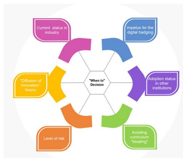
Figure 2: Conceptual Framework of Six Forces (see appendix)

Liu and Murphy (2012) depicted an educator's dilemma as a challenge to find the balance between accommodating new materials emerging from the discipline and maintaining a viable curriculum without overload. The model provides a conceptual framework to help dissect the challenge discussed in the previous sections. We adapted six forces from the original framework to help us make a valid "when and if to implement digital badge" decision, as illustrated in the figure below.